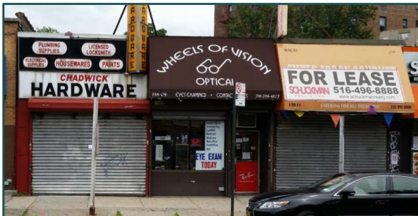
138-07/11 Queens Blvd