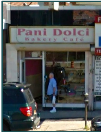
Available: 900 sf