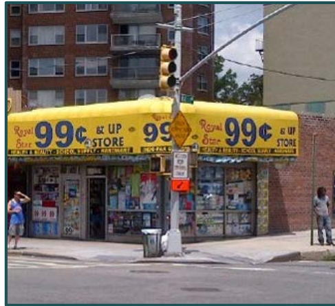
Available: 1,700 sf corner