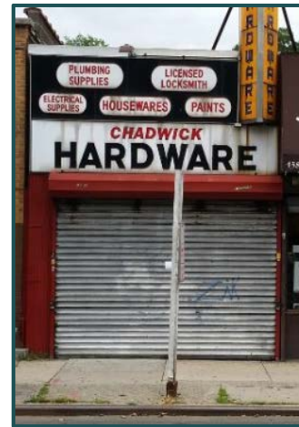
Available: 750 sf

The information contained herein was obtained from sources deemed reliable; however, Malachite Group LTD makes no guarantees, warranties or representations as to the completeness or accuracy thereof. The presentation of this property is subject to errors, omissions, change of price, or conditions prior to sale or lease, or withdrawal without notice.